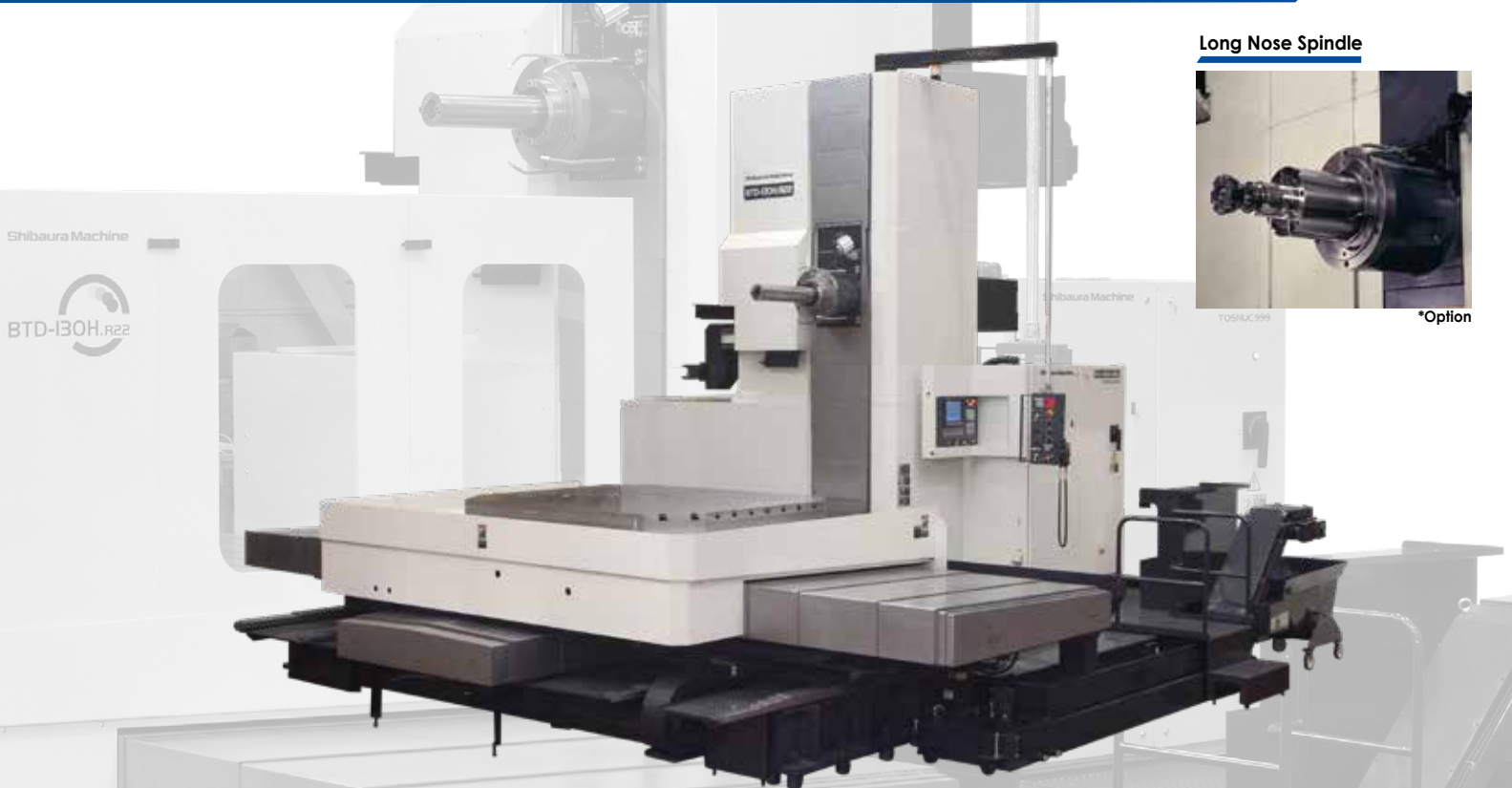
Long Nose Spindle