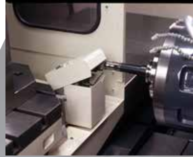
Automatic Tool Length Measuring