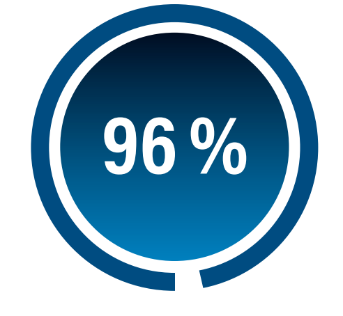
Presence of market leaders