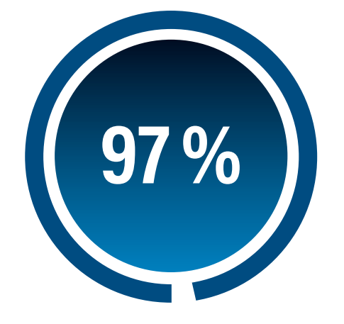
Would recommend the event